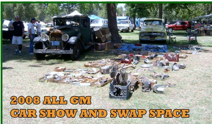
2008 ALL GM CAR SHOW AND SWAP SPACE