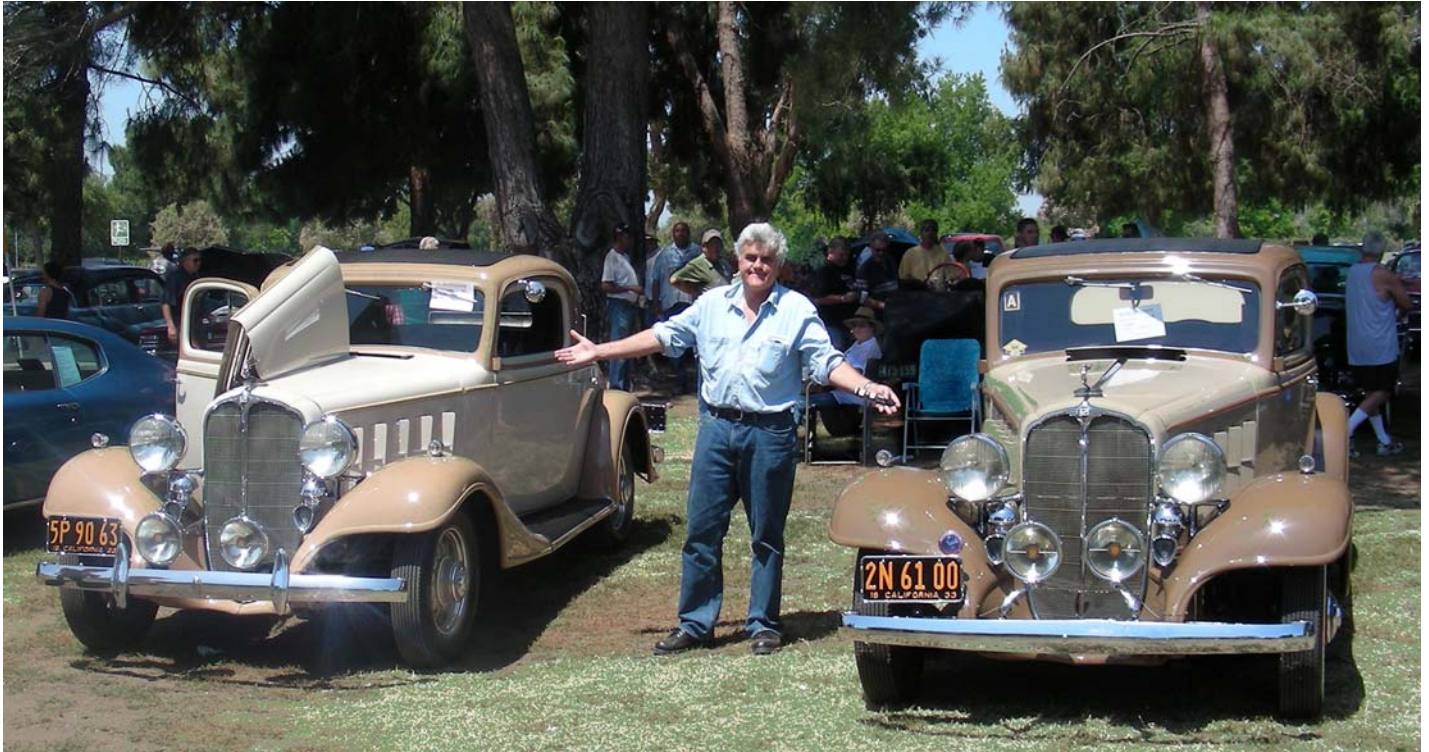
Jay Leno checks out two 1933 Buick Coupes at the All GM Show