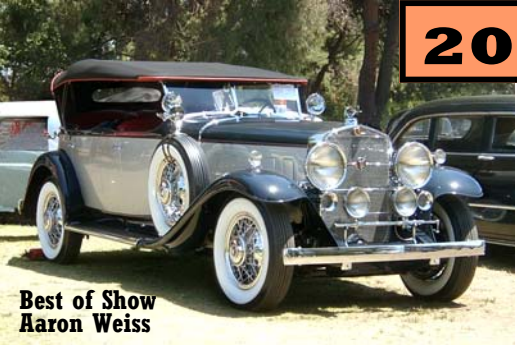
Best of Show Aaron Weiss