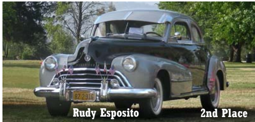
Rudy Esposito 2nd Place