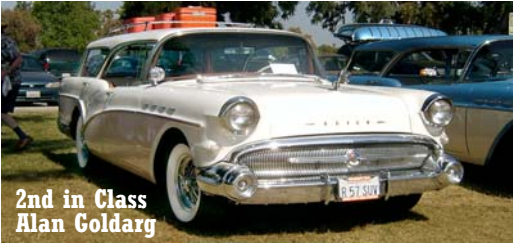
2nd in Class Alan Goldarg