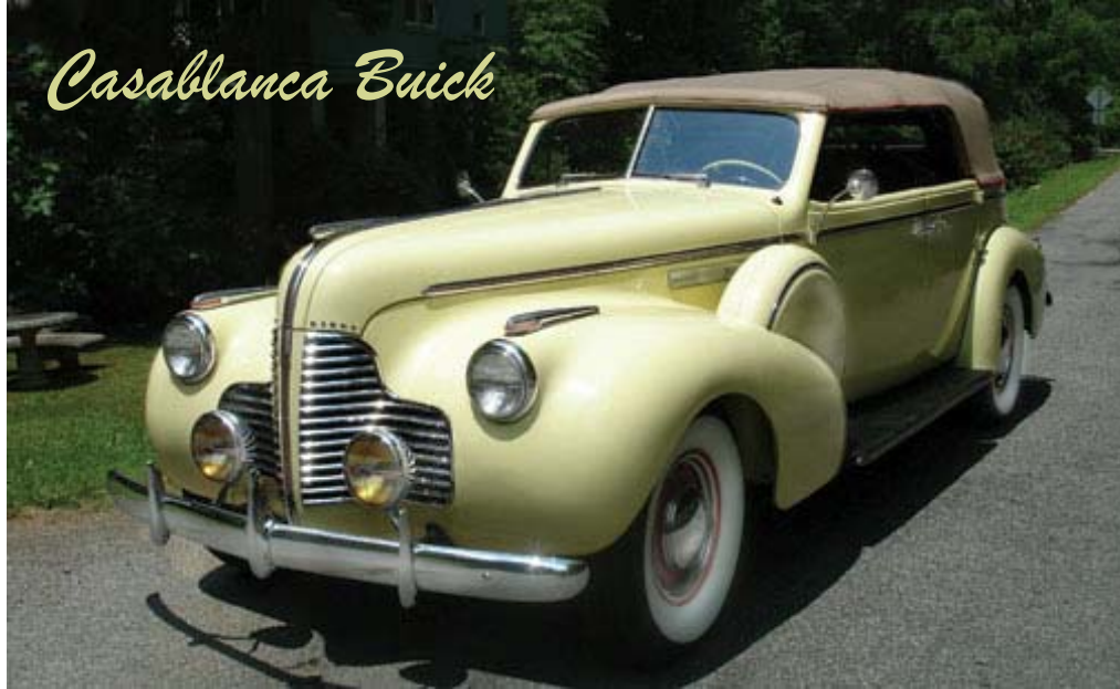
1940 Buick Limited Model 90C Convertible Phaeton - 7 produced.