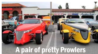
A pair of pretty Prowlers