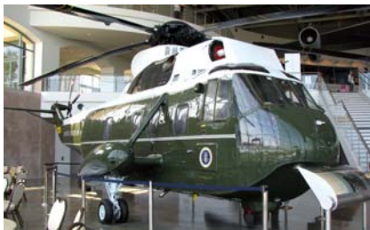
After leaving the treasures of the library building, we went to a huge hangar where the back wall was painted with some of the most historic airplanes of all times. We also saw the other transportation vehicles used by Reagan. Finally by elevator or stairs, we went up to the red carpet entrance of Air Force One. Above and to the right.