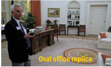
Oval office replica