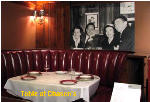
Table at Chasen's