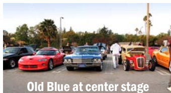
Old Blue at center stage