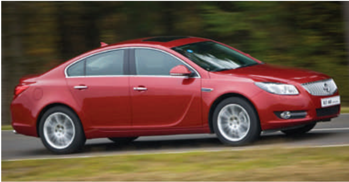
2009 Buick Regal built in China